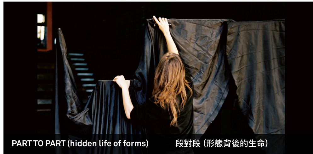
PART TO PART (hidden life of forms)