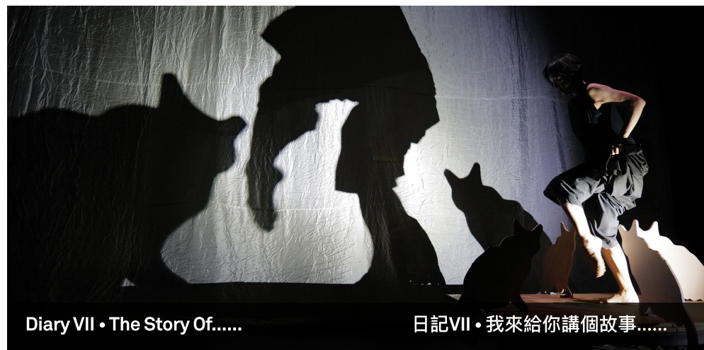
Diary VII • The Story Of.....